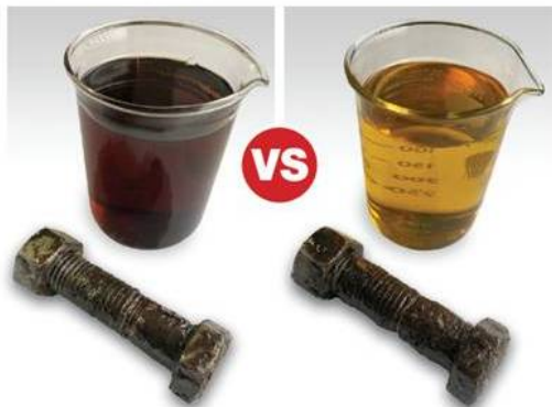
Bolt-Busting Triple Action Lubricants after 8 hours