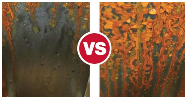
Barracuda Triple Action Lubricant